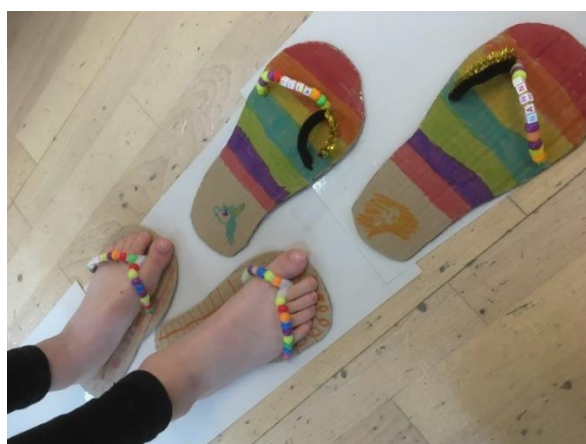
'Road to Emmaus' flip-flops