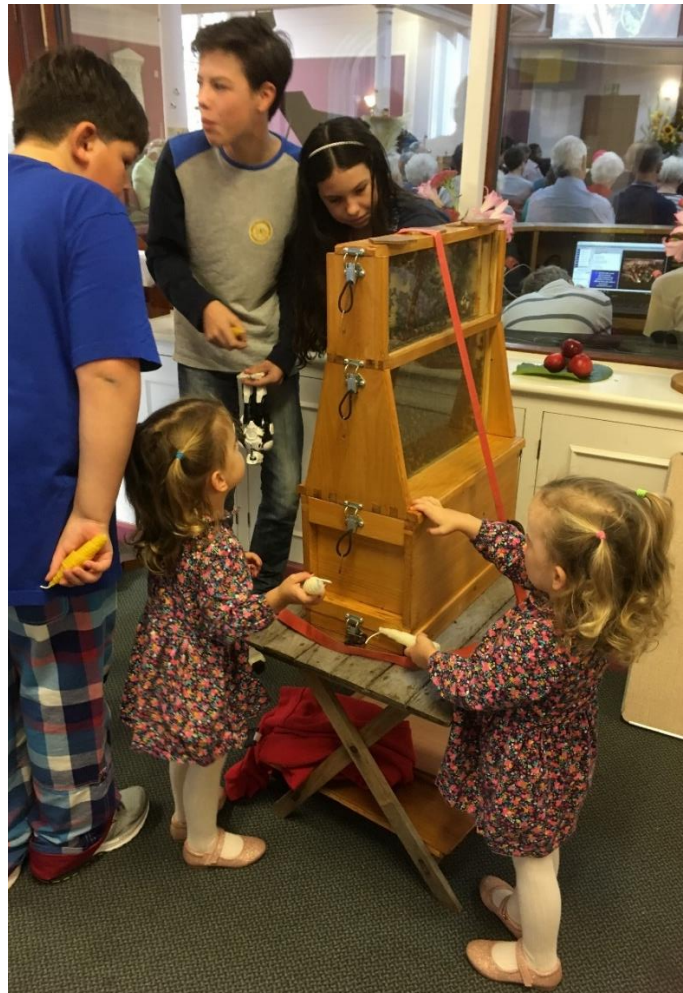
A beehive in the vestibule at Harvest