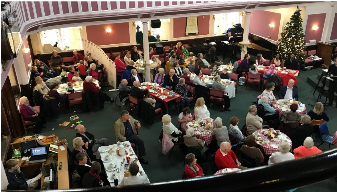
New Year's Eve Service

‘To make disciples and join in God’s mission for change’