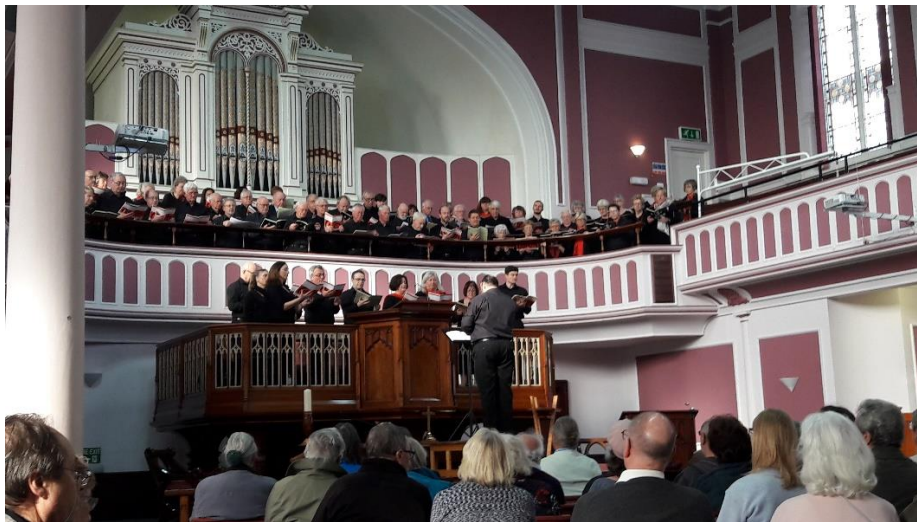
Faure's Requiem on Good Friday