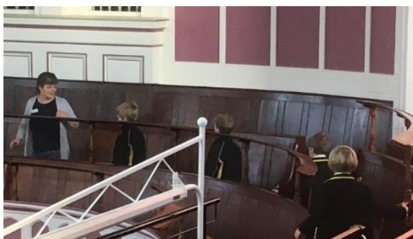
Vic Prep exploring the church