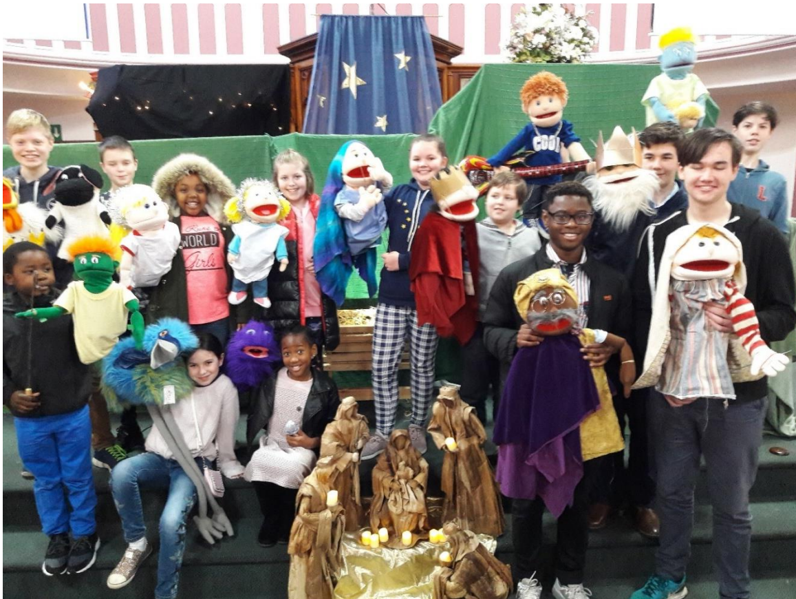
The cast of Bethlehemian Rhapsody