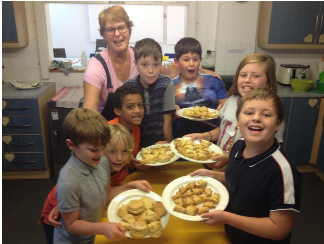
Holiday club baked American biscuits